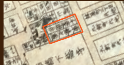
Chiba Shusaku "Genbukan" / Tojo Bunzo (Ichido) "Yochijuku" Nihonbashi-Kita Kanda Hen no ezu (section)

*Nihonbashi-Kita Uchi-Kanda Ryogoku Hamacho (map) is in the possession of the Special Collections Room, Tokyo Metropolitan Central Library