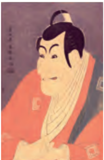
"Ichikawa Ebizo" work by Toshusai Sharaku

Tsutaya Juzaburo was one of Edo's foremost publishers. He released ukiyo-e woodblock print works, including those of Kitagawa Utamaro and Toshusai Sharaku, making them famous. He also established a store named "Koshodo." Koshodo was located on present-day Nihonbashi Odenma-Honcho Dori Street, and an explanatory signboard has been created here.