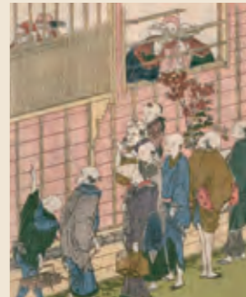
Picture of a Dutchman in Nihonbashi Nagasaki-ya

Picture Book of the Pleasures of the East (Ehon Azuma Asobi) 3 volumes, work by Katsushika Hokusai National Diet Library Digital Collection