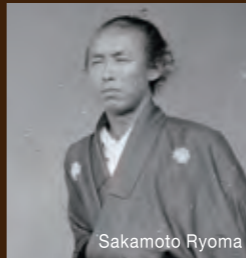
Sakamoto Ryoma In the possession of Kochi Prefectural Museum of Folk History

Samurai from Tosa Domain (Kochi Pref.) such as Sakamoto Ryoma, Takechi Hanpeita, and Okada Izo, all famous as nationalist patriots (shishi) at the end of the Edo period, lodged at the Tosa Domain Nakayashiki (in the present-day area around Chuo City Office) and focused on their kenjutsu training. The Genbukan, where Sakamoto Ryoma received his Hokushin Itto-ryu initiation and mokuroku (license), stood on modern-day Ippachi-dori street near Iwamotocho Station, and an explanatory signboard, "Remains of Genbukan and Yochijuku," has been created here.