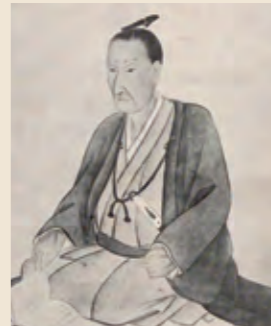
Yoshida Shoin